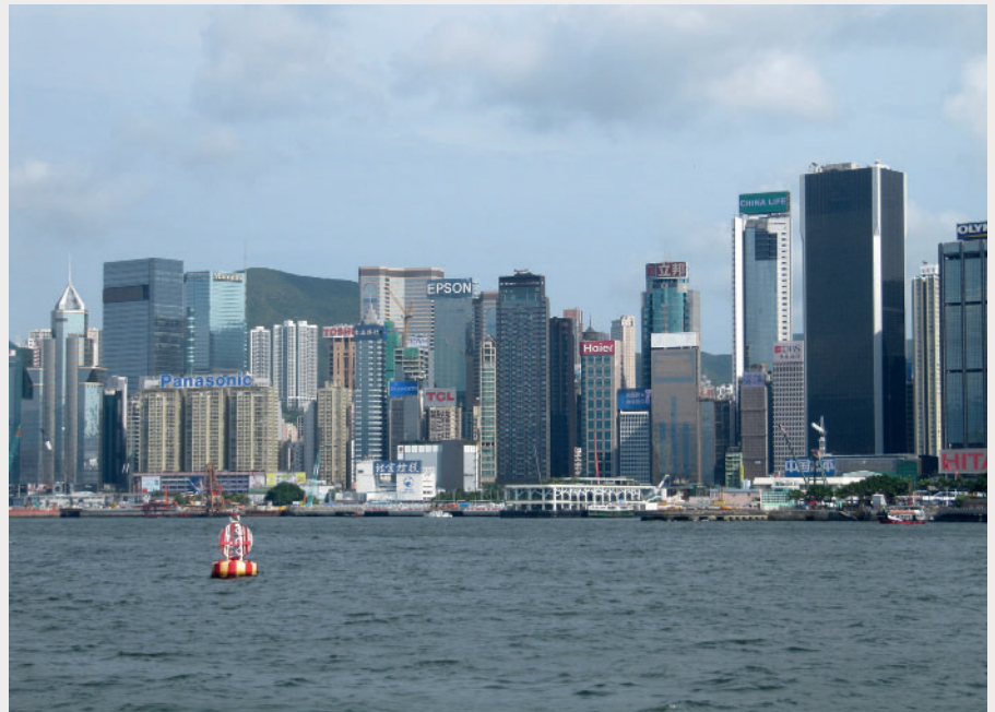
Figure 5 Hong Kong

China's introduction of the Article 34 sedition law in Hong Kong has resulted in a heavy crackdown on large-scale protests. Many people in