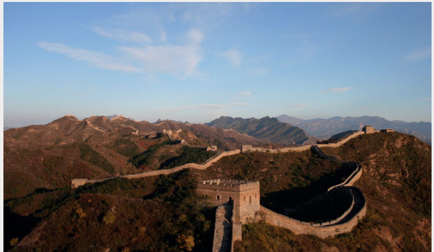
Figure 1 The Great Wall of China – built to keep out ‘uncultured barbarians’